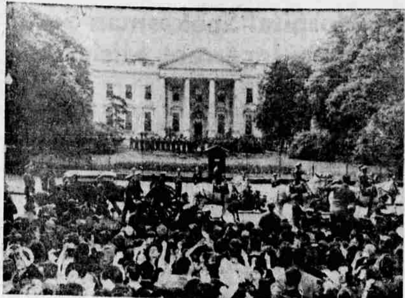
DEATH CAUSED CONFUSION - People crowded the sidewalk as the black caisson bearing the casket of President Franklin D. Roosevelt pulled up before the White House in Washington, D.C., on April 12, 1945. His death, 15 years ago today, caused international confusion. Even his political enemies in this country felt lost without him. But the war surged on to Allied victory.