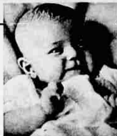
The Day smile at 3 months.