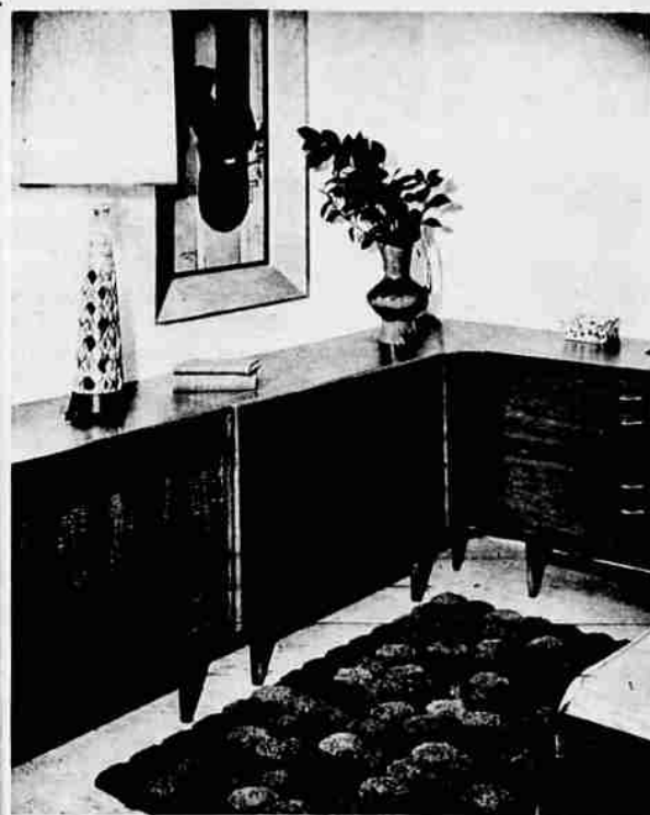
Above, walnut storage chests that fit any room, hold everything. Below, the ever-practical dining-room buffet to match.