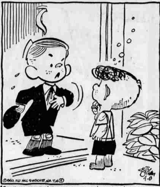
"DO YA HAVTA STARE LIKE THAT? IT'S ME! IT'S ME!"