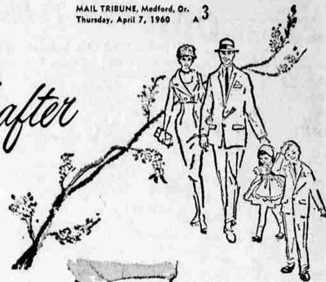
figure-flattering tattersall check suit