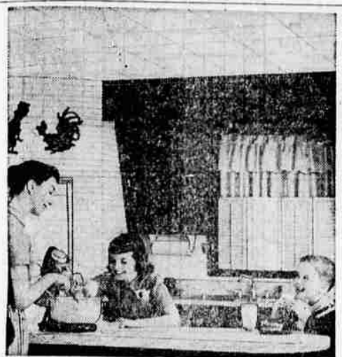
CEILING TILE—Quiet the kitchen by installing colorful, patterned ceiling tile. The comfort of quiet is simple and inexpensive to have in your home. A handyman can easily wash or repaint. Many patterns and colors are available for your choice. See your lumber dealer for details.