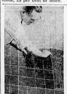
EASY TO DO—"Scored tile," an easy-to-install 4 1/4" tile—go from carton to wall in one motion, with no soaking necessary. They may be set vertically or horizontally without affecting joint alignment, say their manufacturers, American-Olean Tile Company

It is an established fact that good landscaping helps increase the resale value of the home, 25 per cent or more.