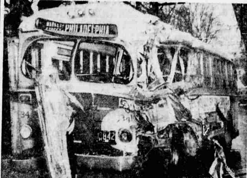
BUS WRECK HURTS 18 —Eighteen persons were injured, two of them critically, when this bus was forced into the path of an oncoming bus by a motorist passing on a curve in driving rain near Pitman, N.J. George Duncan, driver of this bus, was one of the critically injured.