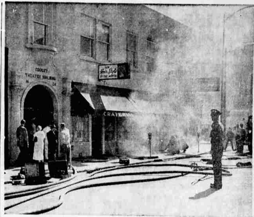
BUILDING BURNS —Pictured above are Medford firemen combatting a fire which burned underneath the floor of the Craterian Beauty Shop, 43 South Central ave., yesterday morning. The fire which started in a men's rest room in the basement was confined to a relatively small area under

The measure, which was tentatively approved by the committee last week, faces efforts at further cuts in the House.