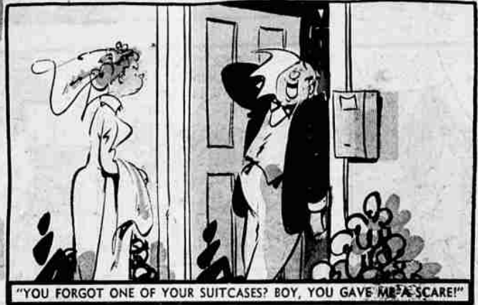
"YOU FORGOT ONE OF YOUR SUITCASES? BOY, YOU GAVE ME A SCARE!"