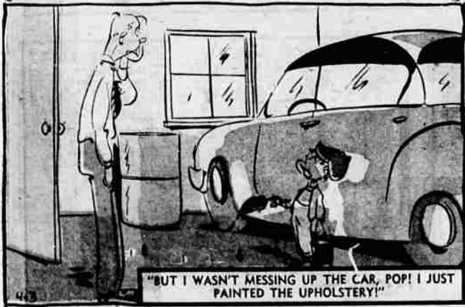
"BUT I WASN'T MESSING UP THE CAR, POP! I JUST PAINTED THE UPHOLSTERY!"