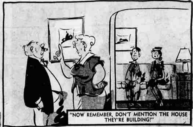
"NOW REMEMBER, DON'T MENTION THE HOUSE THEY'RE BUILDING!"