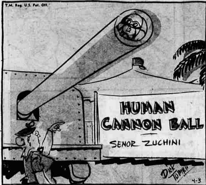
"WATCH OUT FOR THE FERRIS WHEEL, DEAR . . . KEEP YOUR EYES ON THOSE OVERHEAD WIRES . . .!"