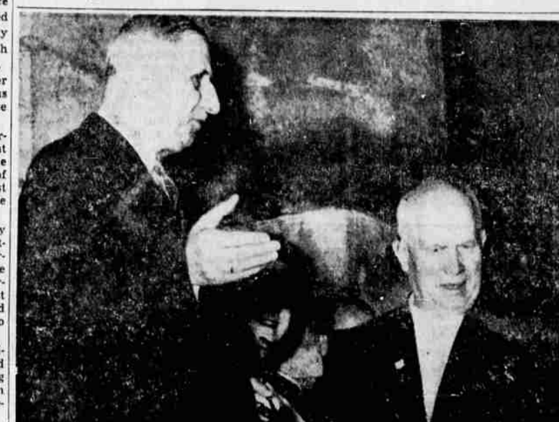
VISIT ENDS—French President Charles de Gaulle gestures as he greets Soviet Premier Nikita Khrushchev as latter arrives at Rambouillet castle for talks. Winding up his visit to France, Khrushchev said Saturday that he was leaving with "increased optimism" about the forthcoming summit conference.