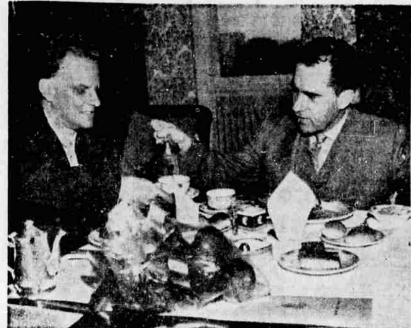
NIXON, GRAHAM VISIT - Vice President Richard Nixon pours coffee for the Rev. Billy Graham during a private luncheon in the vice president's office in Washington. The evangelist, who has just returned from a 2 1/2-month trip overseas, will hold a one-week crusade in the nation's capital in June.