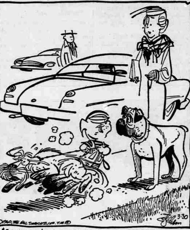
"If you don't get that dog out my way, I'm gonna let ruff fight 'im!"