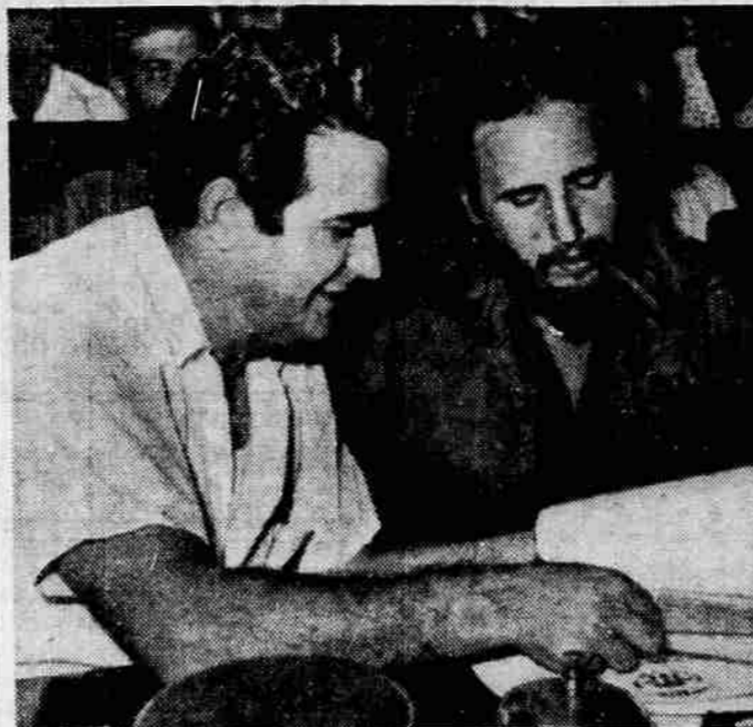
ADDRESSES WORKERS — Prime Minister Fidel Castro, right, addresses the Sugar Workers rally at Havana, at which time he received the agreements of the workers in which they accepted a freezing of their salaries in case there is a sugar quota reduction by the United States. Conrado Becquer, general secretary of the Sugar Workers Federation, left, shows Castro the agreements by the workers.

The first firemen to reach the five-story, red brick building heard several small explosions as whiskey vats burst.