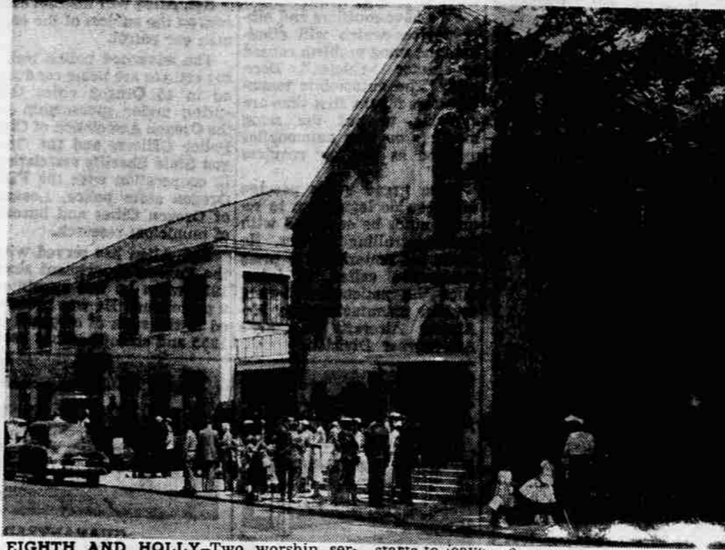
EIGHTH AND HOLLY—Two worship services are held each Sunday morning at First Presbyterian church, Eighth and Holly sts., to accommodate the congregation of nearly 1,540 members. Above, part of the congregation at the 9:30 a.m. service starts to leave the church.

When the congregation oversubscribed a bell fund drive, the extra money was used to pay the cost of heating the church. A problem which had been facing the