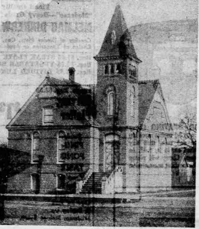
PREBYTERIAN CHURCH—The second building constructed in Medford by the First Presbyterian church was dedicated in 1896. Made of brick, the first lamps used were a gift from the King's Daughters, a church organization of teen-age girls, and cost $28. The building faced on West Main st. and was at the intersection of South Holly st. In 1910 the lighting of the auditorium was improved by the installation of six tungsten light globes of 100 candlepower each and the half block of sticky gumbo in front of the manse (to the rear of the church) was paved for $105.

In 1950. He had been a missionary in China. Dollar for Dollar