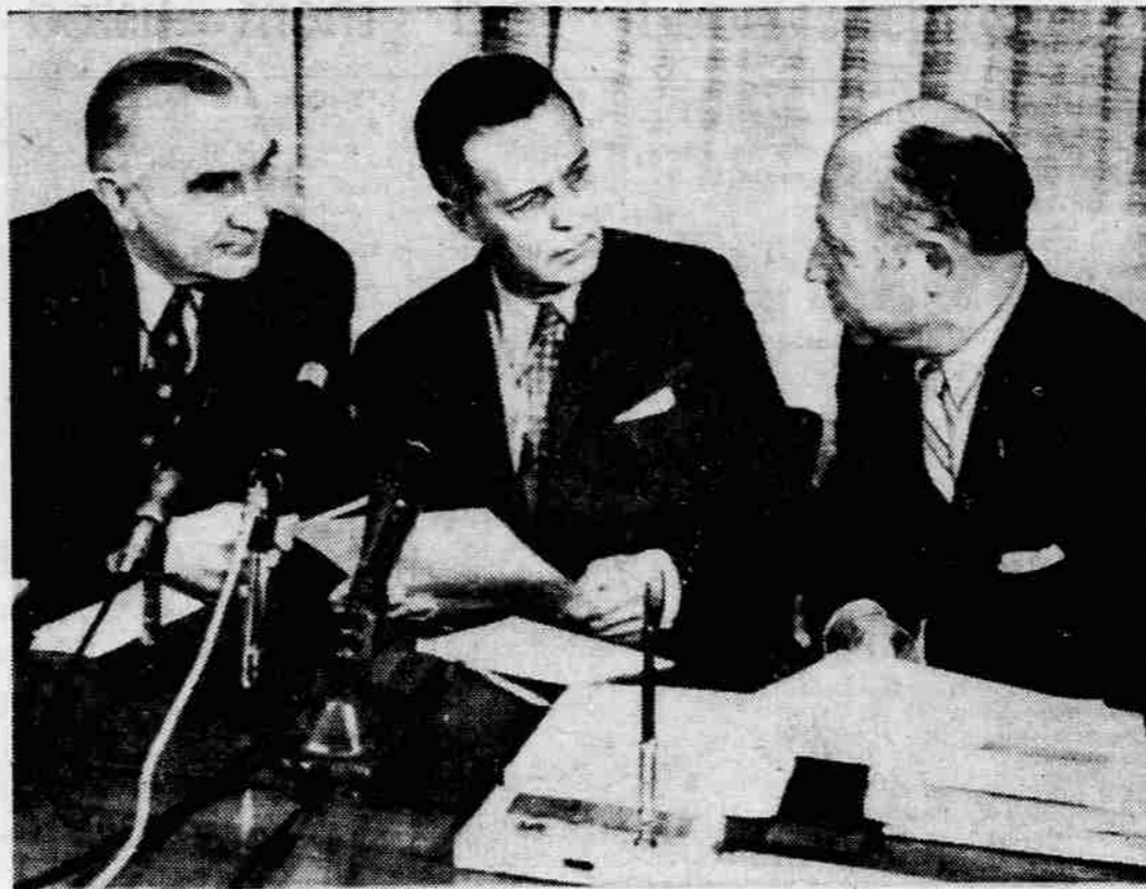
AMENDMENT DISCUSSED - Sens. Wayne Morse (D-Ore.), left, Joseph S. Clark (D-Pa.), center, and Jacob Javits (R-N.Y.) discuss the Clark-Javits amendment to the strength in the Senate for a meaningful voting rights bill. The amendment is a combined referee-registrar voting rights plan. Sen. Morse has moved to table it in hopes that the vote on the motion will give some indication of the strength in the Senate for a meaningful voting rights bill.