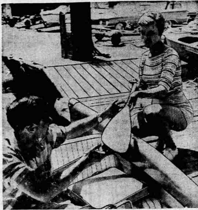
NEVER FAIL —Oars and paddles never fail and it is always a good idea to have a pair in case the engine does not operate properly when you're far from shore. This is an inexpensive safety precaution.