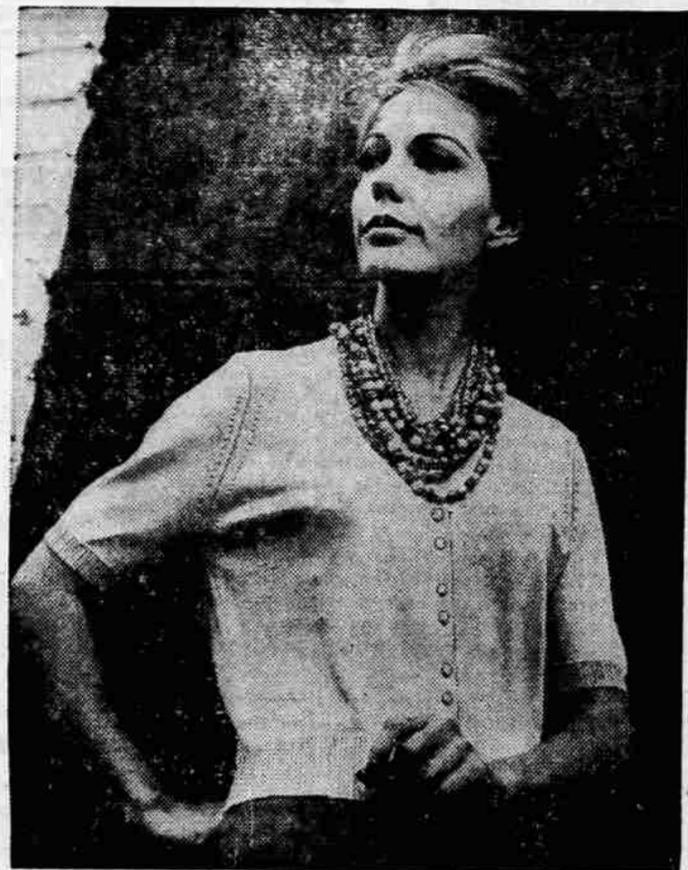
FRESH SHAPING —Fresh neckline shaping—outlined by heaps of beads, crystals, pearls—is spring '60 news in this full-fashioned cardigan sweater. It joins forces with a slim knit skirt. By Darlene in Orlan Cantreze.