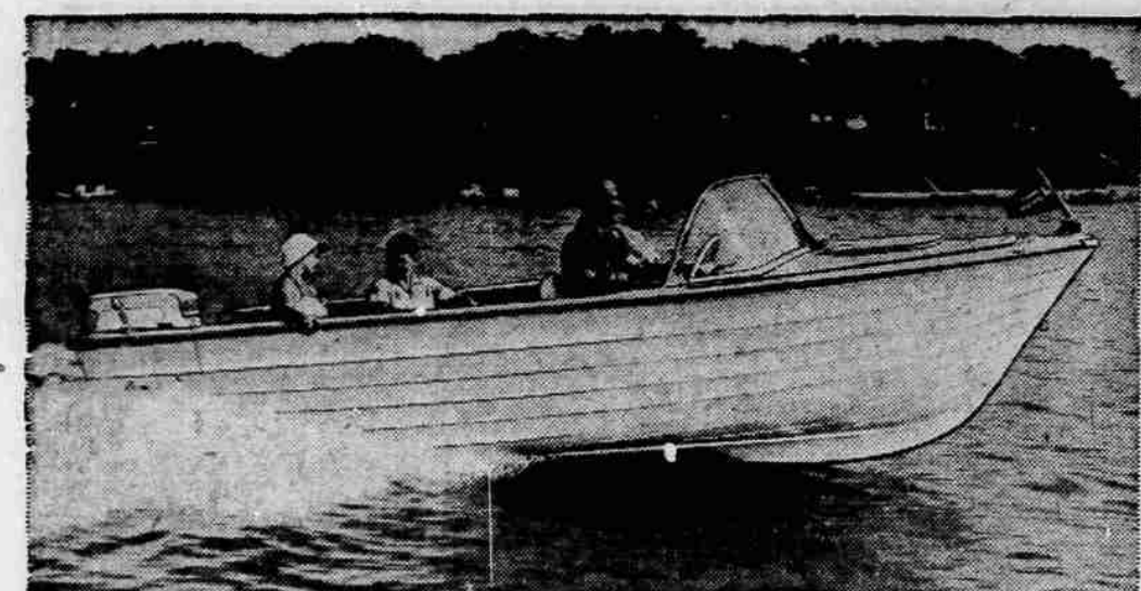
LITTLE UPKEEP —Wagemaker Clipper is construction needs little upkeep. At the about 18 feet long, takes motors up to 100 recent National Motor Boat Show she was horsepower. The clinker-molded fiber glass priced about $1,400.

Sunday, Boy Scout troop 8, will have its exhibit on display. The theme is "Realistic First Aid." There are 40 boys in the troop, with 10 den leaders. Scoutmaster is Elwood Hedberg and Assistant Scoutmaster is Bob Frick.