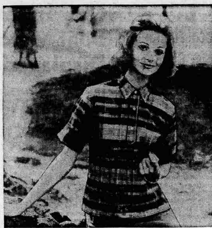
GIVES FASHIONS — Madras-type jewel-toned plaid and meticulous tailoring fashion gives distinction to this shirt. It has button-down collar, tab front closing and roll-up sleeves. "Song of India" shirt by Shapley Classics.

COURTESY AIDS SAFETY Courtesy on the water is as old as tradition itself. Courtesy toward fellow boaters will also insure safety, for most rules on our navigable waters are really based on common sense and regard for the other fellow.