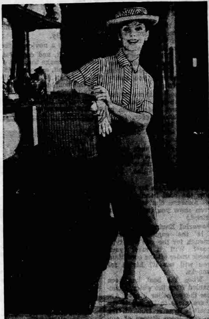
DISPLAY MANNERS —Cotton knits display town and country manners in these clean-cut separates. The candy-striped shirt has rolled sleeves and elongated placket. Skirt comes in matching spring colors. Both are by Aileen.

If you cannot obtain all these items from your local sporting goods store, they are available by mail from Abercrombie & Fitch in New York, Chicago, San Francisco and Palm Beach.