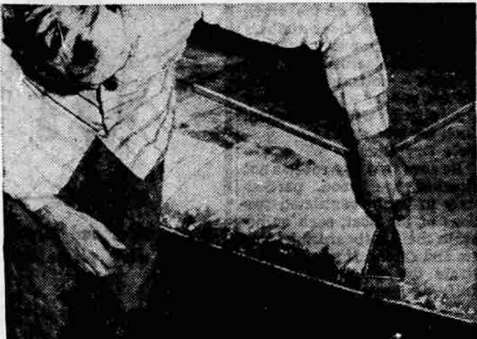
ALWAYS A PROBLEM —Dry rot is always a problem at fitting out time. After rotted area has been cleaned out, sometimes it's possible to patch it with fiber glass. Plastic sands smooth.