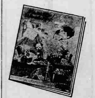
Medford Mail Tribune

"When HOMEMAKERS of the FUTURE COOK " Family Weekly COOKBOOK SECTION with your MARCH 27th (Name of Newspaper)