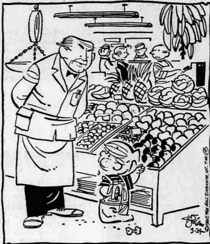
"DO YOU HAVE A DINER'S CARD?"