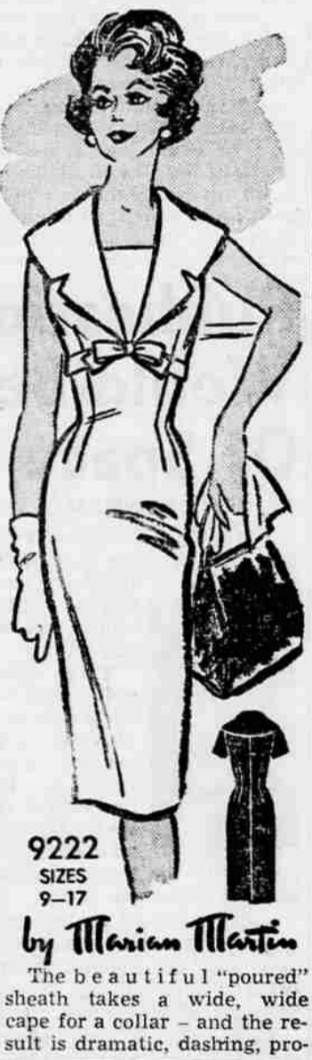
9222 SIZES 9-17 by Therian Martin The beautiful "poured" sheath takes a wide, wide cape for a collar - and the result is dramatic, dashing, provocative. High-placed bow emphasizes sleek waist. Choose cotton, shantung, linen. Printed Pattern 9222: Junior Miss Sizes 9, 11, 13, 15, 17. Size 13 takes 3 3/4 yards 35-inch. Send FIFTY CENTS (coins) for this pattern - add 10 cents for each pattern for first-class mailing. Send to Marian Martin, Medford Mail Tribune, Pattern Dept., 232 West 18th St., New York 11, N.Y. Print plainly NAME, ADDRESS, SIZE and STYLE NUMBER. JUST OUT! Big, new 1960 Spring and Summer Pattern Catalog in vivid, full-color. Over 100 smart styles... all sizes... all occasions. Send now! Only 25c.