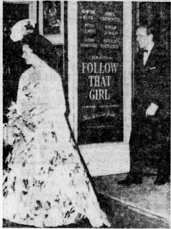
London—Antony Armstrong-Jones ignores the name of the musical, "Follow That Girl" but does exactly that in case of Princess Margaret. He will be following "that girl" the rest of his life as protocol prescribes he trail her by three paces. The engaged couple are shown as they arrived to attend the premiere of the musical written by Julian Slade, once a close friend and member of the Princess' party-going set.