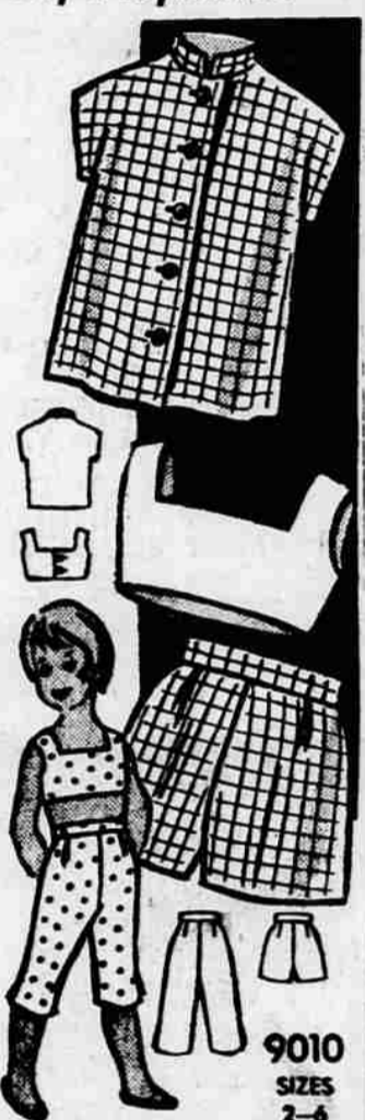
9010 SIZES 2-6 by Marian Martin

The GAYEST playtimers - Easiest sewing! Make them cool, colorful, easy-to-care-for in striped denim, bright cotton or no-iron blend. Send now! Printed Pattern 9010: Children's Sizes 2, 4, 6. Size 6 jacket takes 1 yard 35-inch; bra 3/4 yard; shorts 3/4 yard. Send Thirty-five cents (coins) for this pattern - add 10 cents for each pattern for first-class mailing. Send to Marian Martin, Medford Mail Tribune, Pattern Dept., 232 West 18th St., New York 11, N. Y. Print plainly NAME, ADDRESS with SIZE and STYLE NUMBER. JUST OUT! Big, new 1960 Spring and Summer Pattern Catalog in vivid, full-color. Over 100 smart styles . . . all sizes . . . all occasions. Send now! Only 25c.