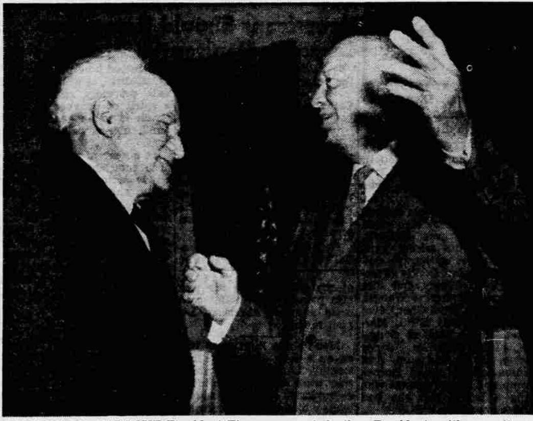
BEN-GURION, IKE VISIT -President Eisenhower presented the President with an album showing appreciation of the Jewish people with Israeli Prime Minister David Ben-Gurion at the White House. Ben-Gurion from World War II concentration camps.

JUST OUT! Our New 1960 Alice Brooks Needlecraft Book contains THREE FREE Patterns. Plus ideas galore for home furnishings, fashions, gifts, toys, bazaar sellers - exciting, unusual designs to crochet, knit, sew, embroider, huck weave, quilt. Be first with the newest - send 25 cents now!