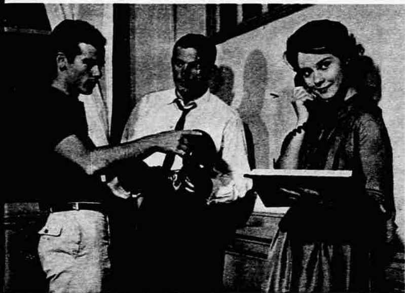
Johansson-of-all-trades rehearses one of his scenes from the TV production of "The Killers" with Diane Baker and Dean Stockwell.