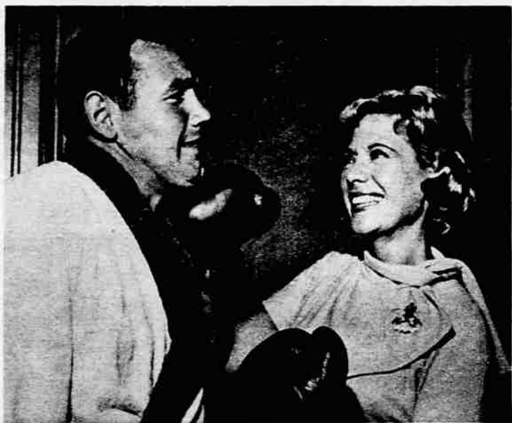
Ingo kids with Dinah Shore while waiting to go on her TV show.