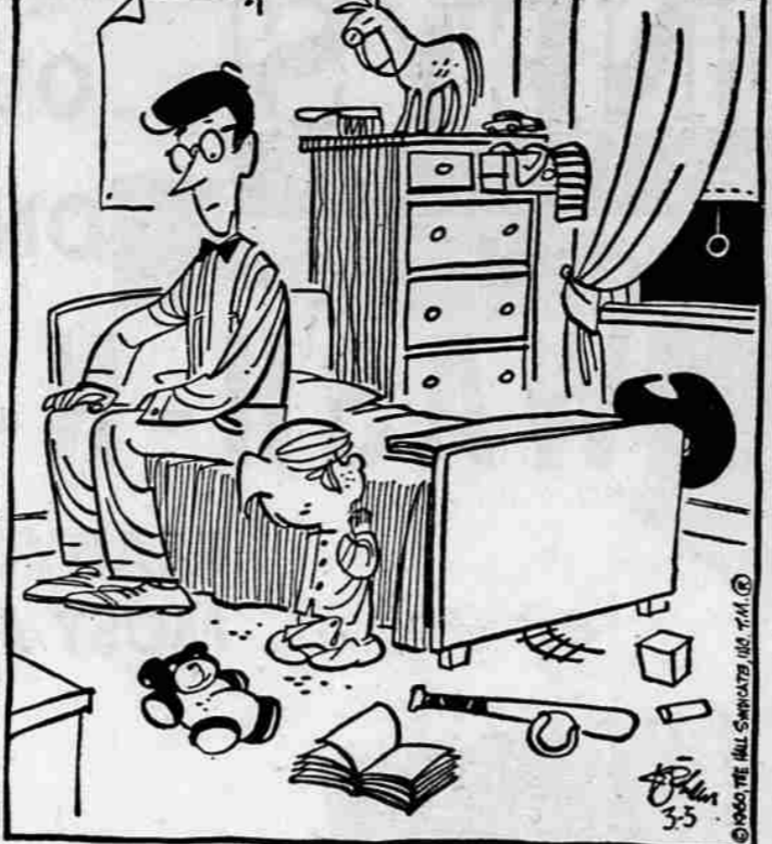
... AN MAKE ME A GOOD BOY, BUT NOT SO GOOD I DONT HAVE NO FUN!