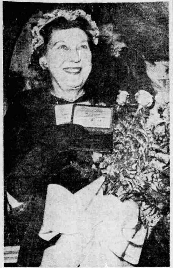
MAMIE RECEIVES GIFT PASSES - Mrs. Mamie Eisenhower displays gold passes to the 10th anniversary National Capital Flower and Garden show which were presented to her at the White House Wednesday. Officials of the show also presented the First Lady with a bouquet of roses.