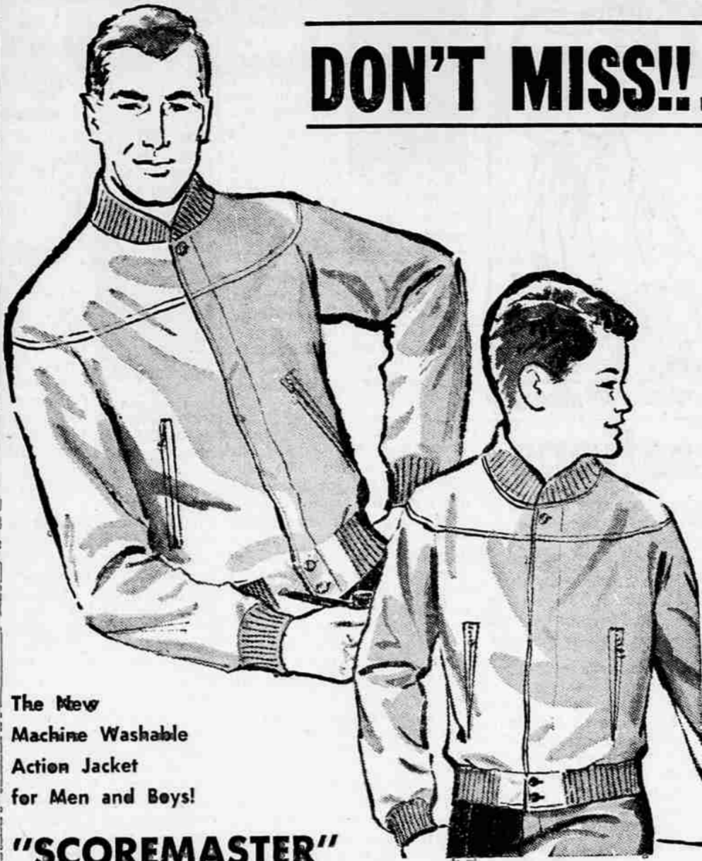
The New Machine Washable Action Jacket for Men and Boys!