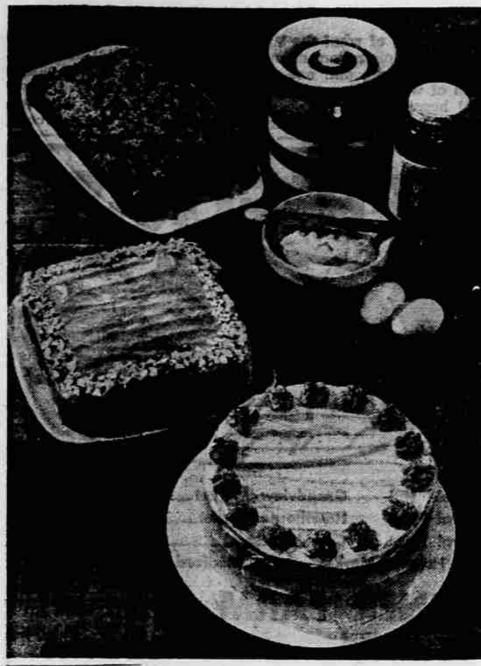
HANDSOME TRIO -A handsome trio of taffy colored, molasses flavored frostings. A quick butter-coconut molasses frosting gets boiler treatment. A penuche frosting tops a spice cake and seven-minute frosting gives taffy touch to layer cake.

Tea Cake Special: For quick tea cake, spread day-old cake slices with butter,