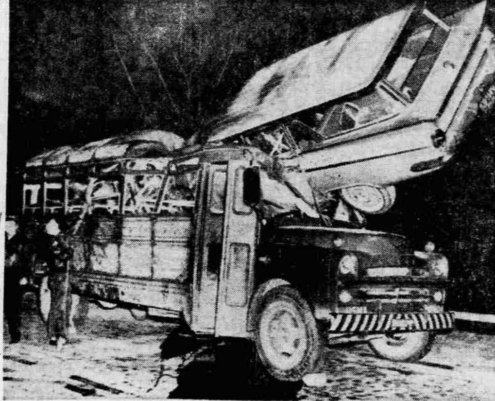
CAR GROWS ON BUS - A station wagon seems to grow from a West Point, N.Y., bus after the larger vehicle hurtled off a curve in Bear Mountain State Park. The bus hit the parked station wagon, ending its plunge, and the car stuck in the bus when it was righted. Ten cadets and their driver, from West Point, were hospitalized.