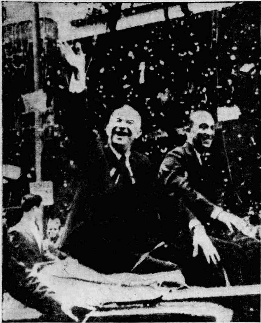
CROWDS GREETED—President Eisenhower waves to crowds as he rides atop a car with President Juscelino Kubitschek in a parade today.