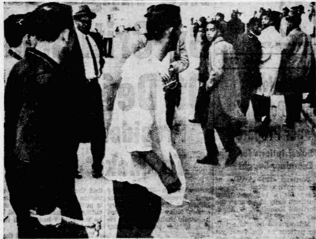
FIGHT BREAKS OUT - A Negro protest of youth was taken to a hospital. The youths segregated seating broke into a chain-swinging street fight at Portsmouth, Va., between white and Negro teen-agers. One white youth was taken to a hospital. The youths scattered when police arrived and no arrests were made. Note the youth, left, with a hammer in his hand.