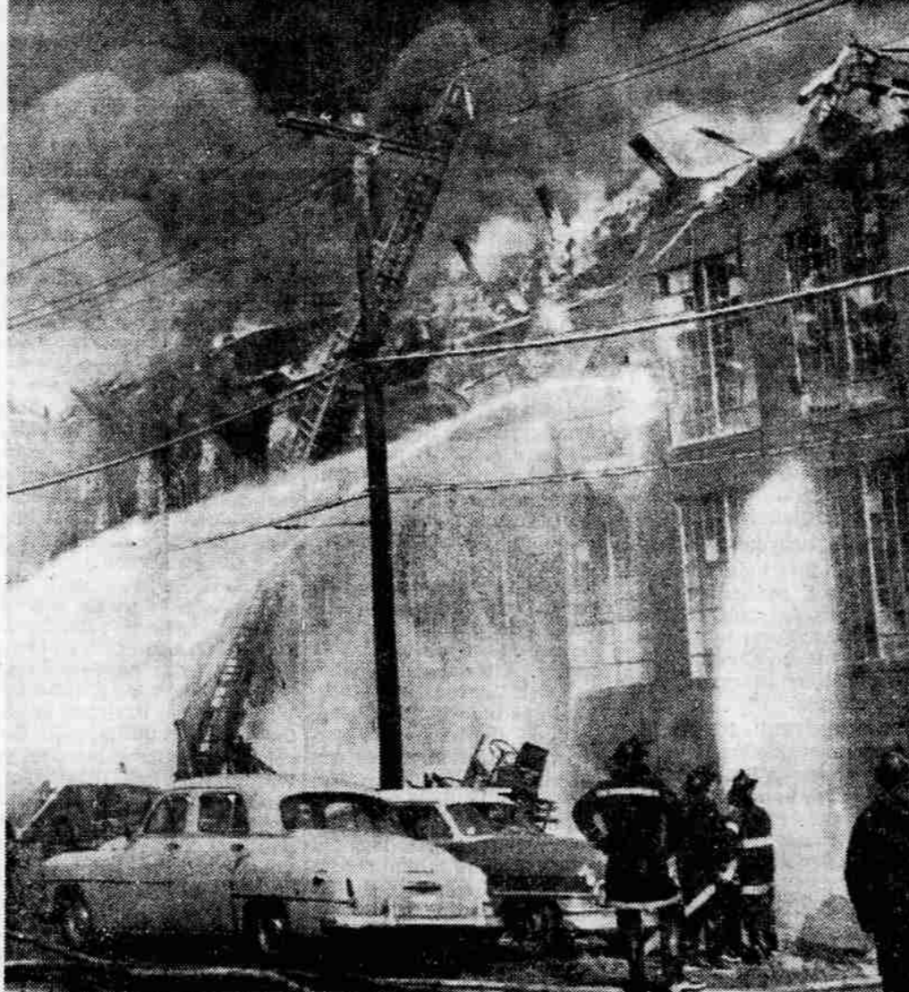
FACTORY DESTROYED - Flames swept three-block-long factory. The plant was through the Velveray Corp. textile plant at rocked by a series of explosions shortly Clifton, N.J., today, wrecking the five-story, after 9 a.m.