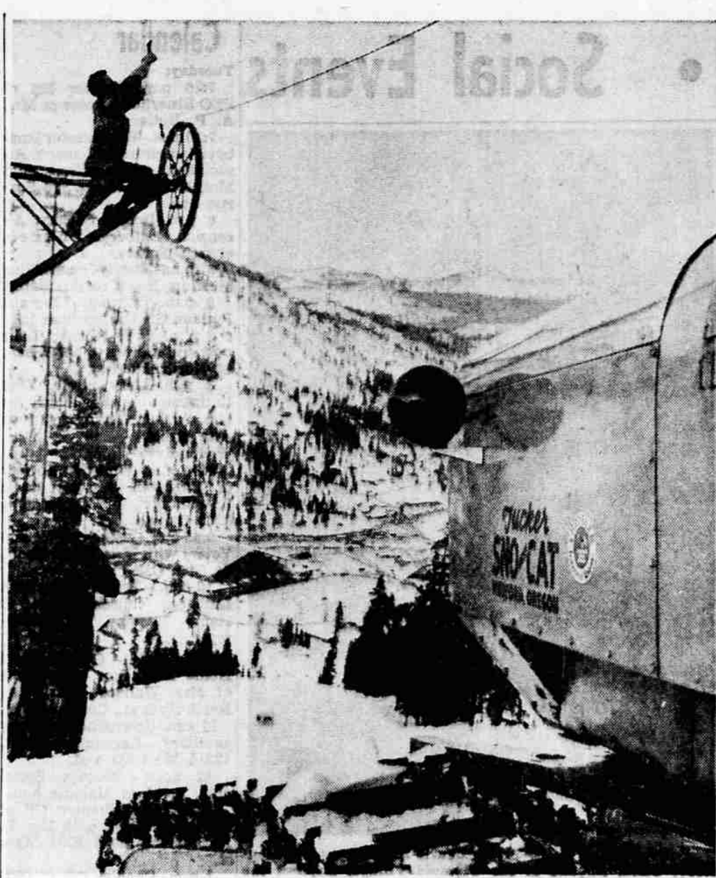
SNO-CATS AT SQUAW VALLEY —Nine Tucker Sno-Cats, manufactured at Medford, are on loan to the Olympic committee for use at the Winter Games which start this Thursday at Squaw Valley in California. The snow vehicles proved helpful recently when a week of unseasonal rain threatened to disrupt the Winter Olympics. Last minute emergency repair work was necessary on ski tows to make sure games started on schedule. Maintenance crews working round the clock, traveled over the steep storm-drenched terrain in famous, Chrysler-powered Sno-Cats.

Both Medford Junior highs had basketball engagements this afternoon at seventh, eighth and ninth grade levels. Hedrick was at North Grants Pass and South GP was at McLoughlin. Central Point seventh and eighth go to Ashland on Thursday and Crater freshman vie at Ashland on Friday.