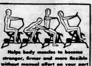
Helps body muscles to become stronger, firmer and more flexible without manual effort on your part

EXERCYCLE is a complete home gymnasium in itself. No form of artificial stimulation such as massages, baths, vibrations, slenderizing or reducing techniques can match its overall efficiency. Once you own an EXERCYCLE, you have solved your exercising problems for a lifetime. Start now to turn back the clock. Step out tomorrow feeling like a million! RELAXED OR ACTIVE EXERCISES! EXERCYCLE is fully adjustable to your present and future physiological needs. There's no limit to how easily or actively you can exercise with it. It builds you up gradually, allowing you to expand your activities as your muscles become stronger and more flexible, without ever exceeding your limitations.