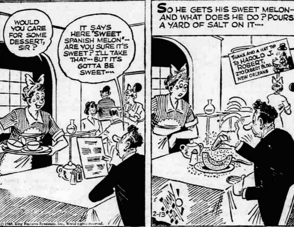
SO HE GETS HIS SWEET MELON—AND WHAT DOES HE DO? POURS A YARD OF SALT ON IT—