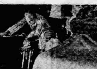
SMALL, SILENT AND ECONOMICAL! Exercycle is so small, compact and silent, most users keep it in their bedrooms. Fits into any small nook or corner. You can ride it while others sleep. Plugs into any wall socket. Uses less electricity than a TV set. Buy it on easy terms.

WONDERFUL FOR OLDER FOLKS! Improves Circulation... Doctors tell you that increased action of the main body muscles will instantly step up your circulation. If your circulation is sluggish, increasing the rate of flow through your arteries and veins will make you feel and stay