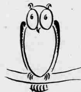
You've drawn an owl, too-who, too-wit!