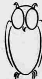
A few brief lines—and look a bit—