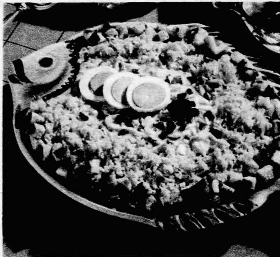
Crab Meat au Gratin is the perfect main dish for a casual comp

■ For informal entertaining, an attractive casserole takes top place on the menu. This perfectly delicious treatment of crab meat in a creamy sauce is no exception. The recipe for this intriguing combination of ingredients, which will please everyone, is sure to go into your "make-it-again" file. The suggestions to accompany the crab-meat casserole are in good taste, too, and are simple to prepare. These culinary "go-togethers" all add up to a wonderful repast for supper dining.