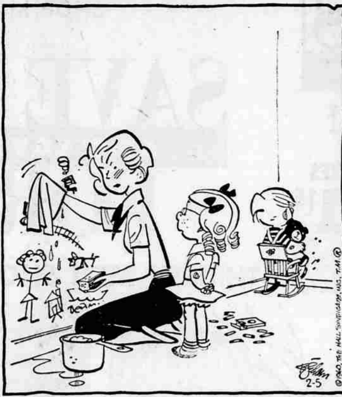
"I THOUGHT THE TRAIN WAS RATHER GOOD."