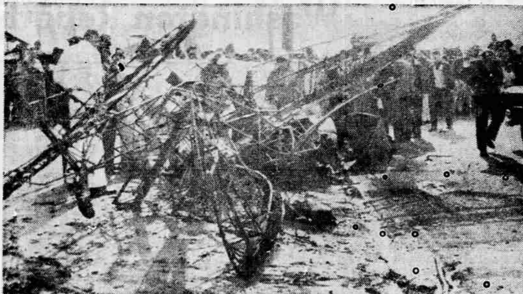
PLANE, CAR CRASH —Two persons were killed at Compton, Calif., when a small plane struck an auto and crashed into a parking lot. Police said the pilot, one of the victims, apparently suffered a stroke or heart attack and was unconscious before the crash. The plane caught fire after impact, officers said. The driver of the auto also was killed.