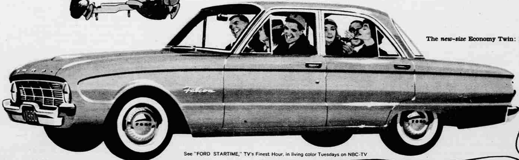
The new-size Economy Twin: Falcon Fordor Sedan

NEXT SUMMER MAYBE I'LL TRY WORKING THE BEACHES..