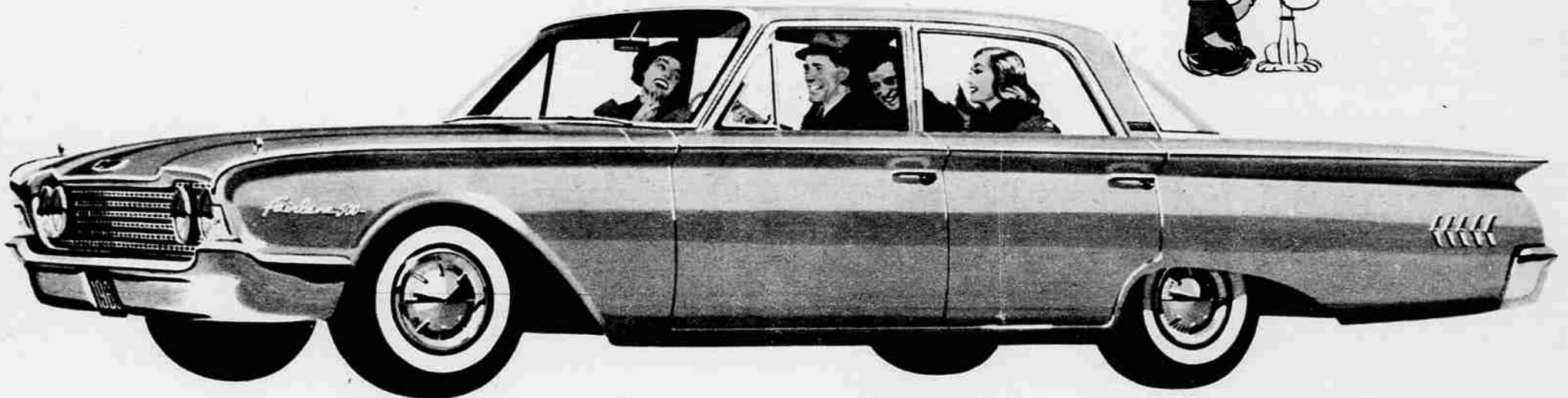
The big Economy Twin: Fairlane 500 Town Sedan