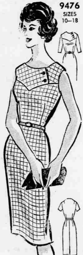
by Marian Martin

The shape of spring is the sleek and narrow sheath. It's simply styled and quietly detailed with buttons on the diagonal. Scooped or high neck, three sleeve versions. Printed Pattern 9476: Misses' Size 10, 12, 14, 16, 18. Size 16 takes 3 1/4 yards 35-inch fabric.