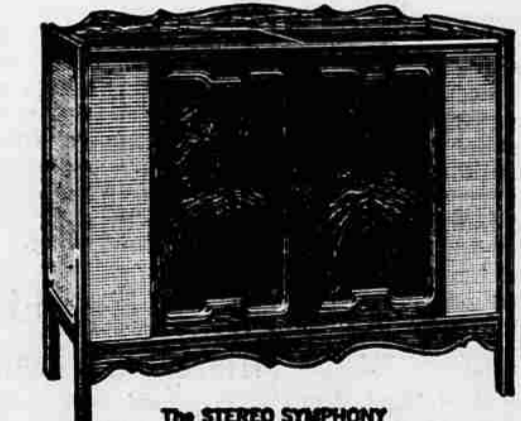
The STEREO SYMPHONY