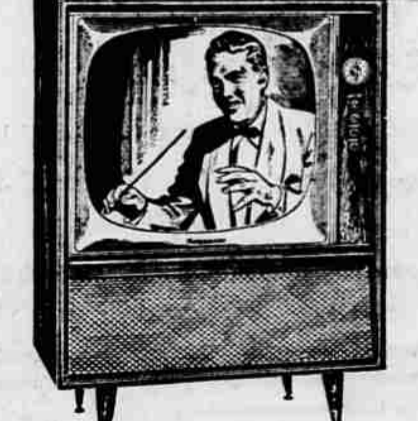
The Magnavox MAGNAVIEW 24