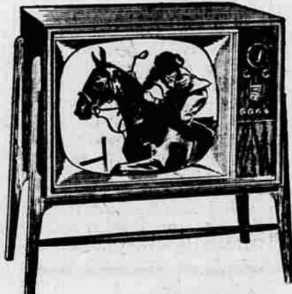
The Magnavox BOULEVARD 21

in mahogany $299 50 PHONOGRAPH ONLY... $269.50 in mahogany