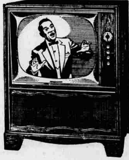
The MAGNAVOX CAVALCADE