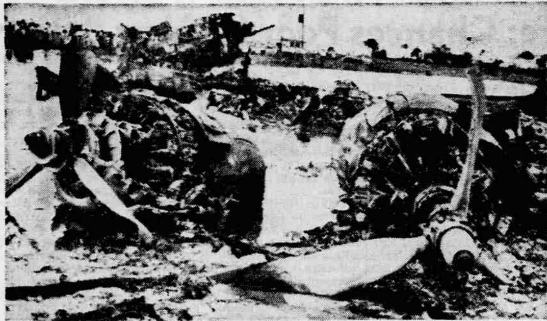
RESULT OF CRASH —An Avianca Airlines Constellation crashed at Montego Bay, Jamaica, after its landing gear collapsed during landing, killing 37 of the 49 persons in the fifth airline disaster of the year. Shown here are two of the craft's four engines, separated by several hundred feet from the fuselage which is shown in the background.