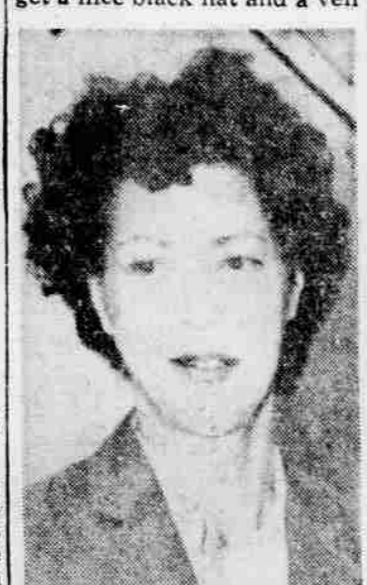
DIANA BARRYMORE Dies in Apartment