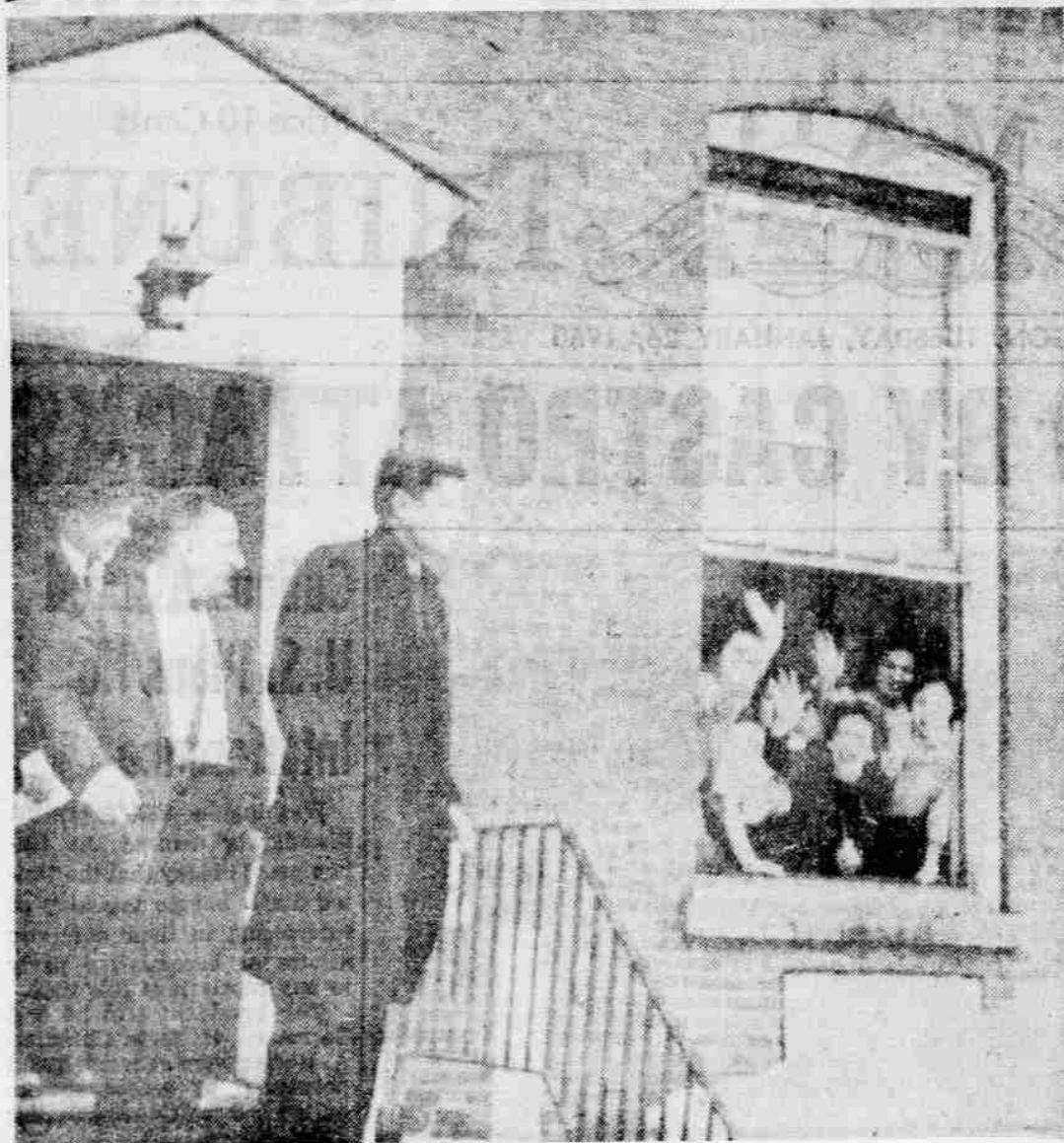
IN MANCHESTER—Sen. John F. Kennedy is applauded by girl workers as he leaves the Arms Textile Mills following his visit in Manchester, N.H., Monday. He began his campaign for nomination for the presidency by the Democratic party with visits to Nashua and Manchester, two of the large population centers in the "Granite State."