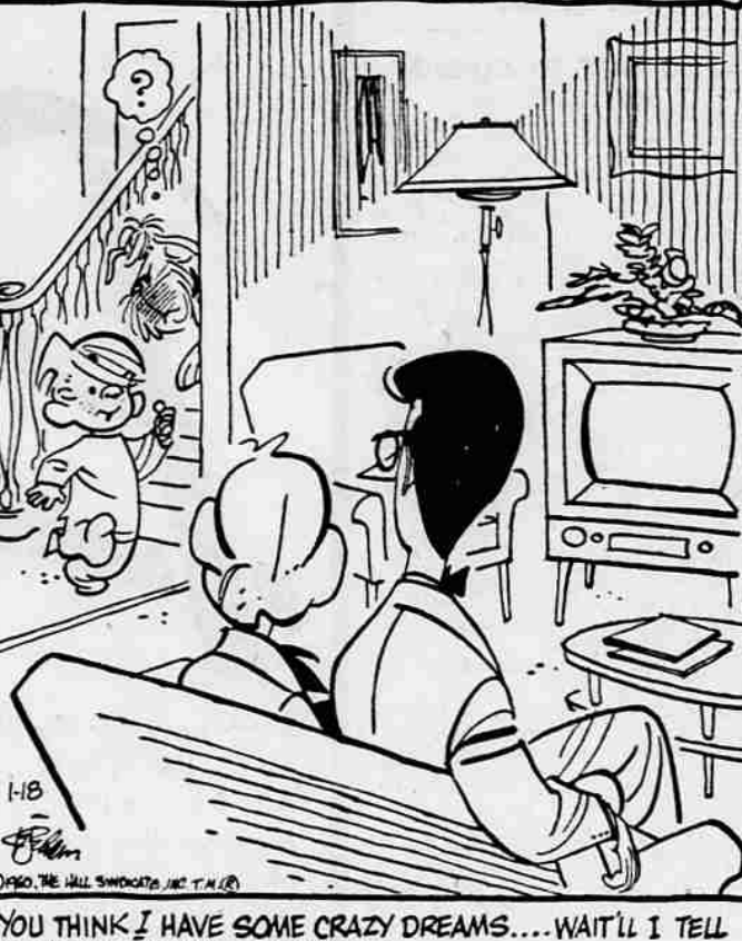
"YOU THINK I HAVE SOME CRAZY DREAMS... WAIT 'TIL I TELL YA WHAT RUFF JUST DREAMED!"