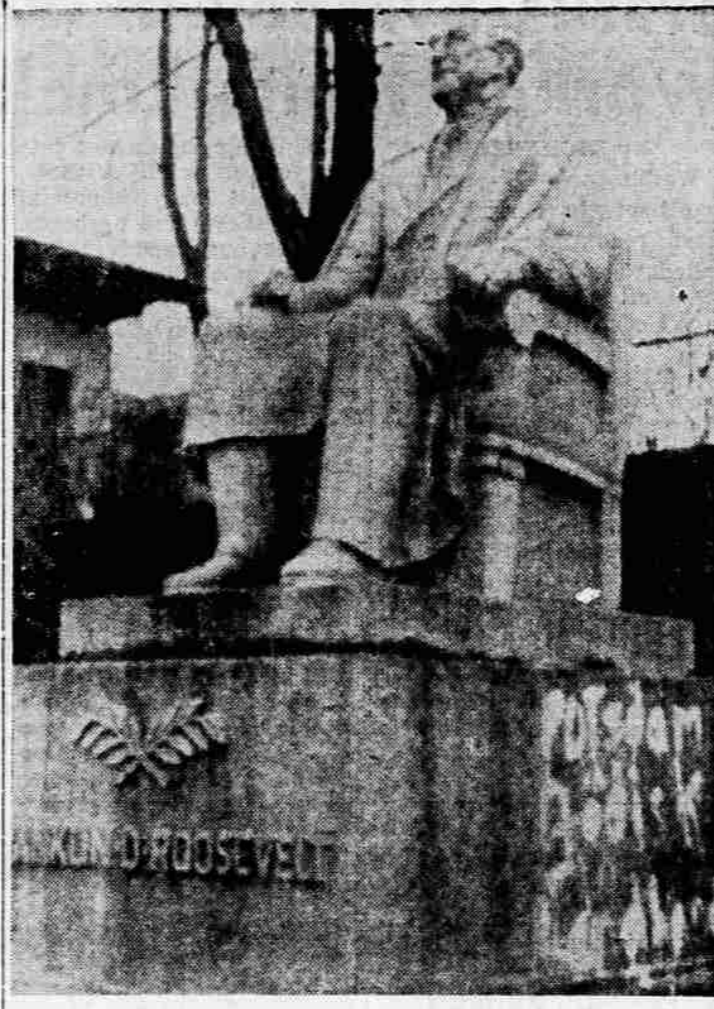
STATUE DEFILED —A statue of former U. S. President Franklin D. Roosevelt is shown in Oslo, Norway, smeared with the words "Potsdam Joedisk Landhandler," meaning Potsdam Jewish Peddler. The statue was raised by the Norwegian people in honor of the late U. S. leader. The incident was the latest outbreak of the anti-Semitic disturbances in much of the world.

The wife of a U.S. President has no official title.