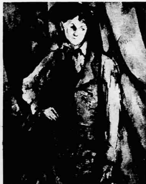
"Boy in a Red Vest" by Cézanne.

painters who live far from art centers can learn to draw and paint through correspondence courses offered by such schools as the Famous Artists' School in Westport, Conn.