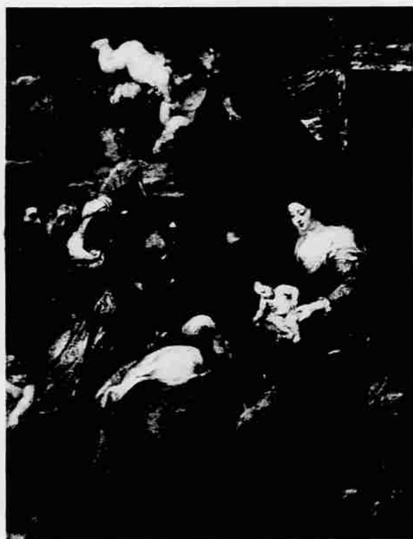
"Adoration of the Magi" by Rubens.