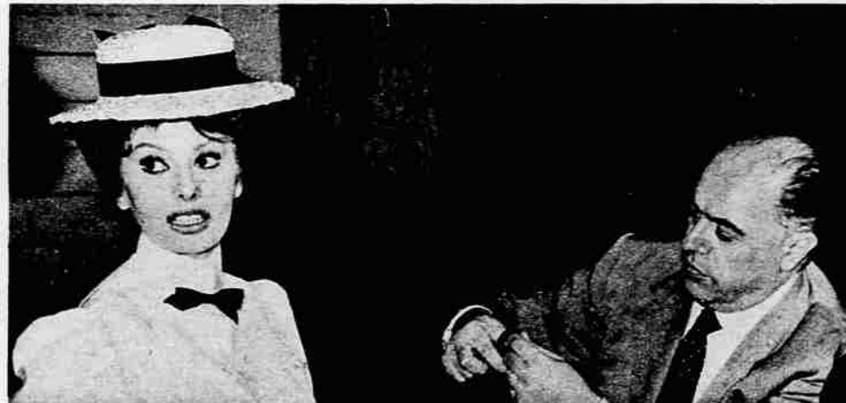
Peasant-girl Sophia Loren, shown on the set of "A Breath of Scandal," was made a star by her balding husband, Carlo Ponti. He couldn't make her a lady, though.

Ponti set out to correct the situation. One noon they were lunching in one of Rome's better restaurants when he