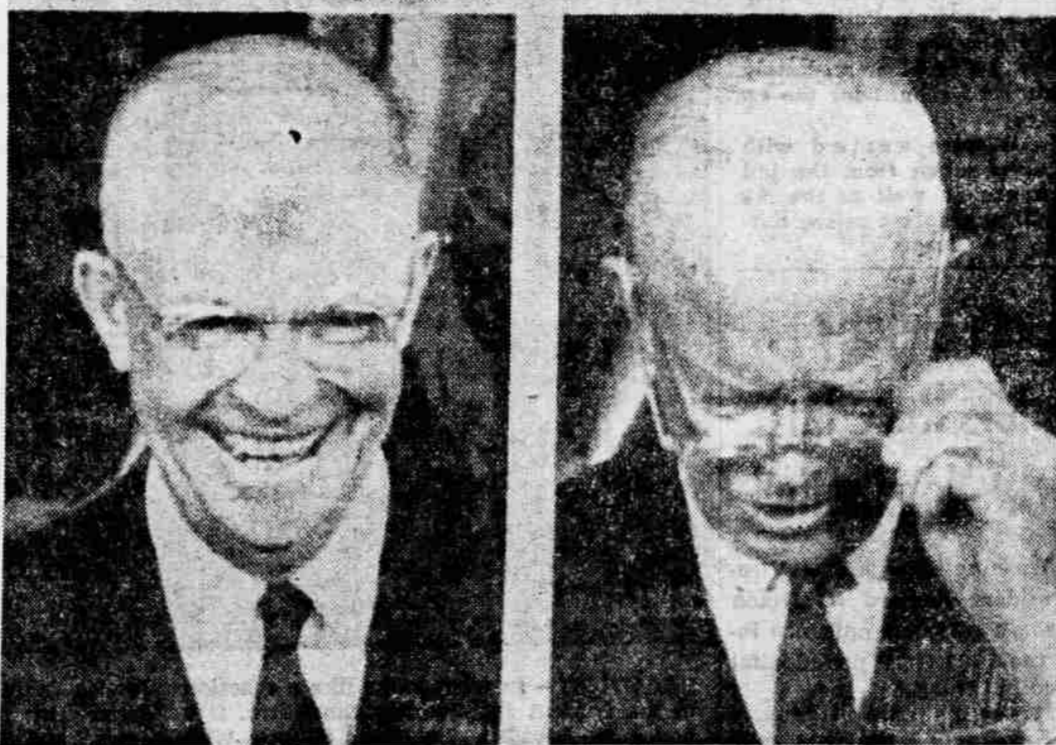
IKE'S SPEECH —Above are candid studies of President Eisenhower as he delivered his State of the Union message to a joint session of Congress in the House Chamber Thursday. The Chief Executive solemnly pledged to devote the "full energies" of his last year in the White House to promote peace in the world and unprecedented prosperity at home.