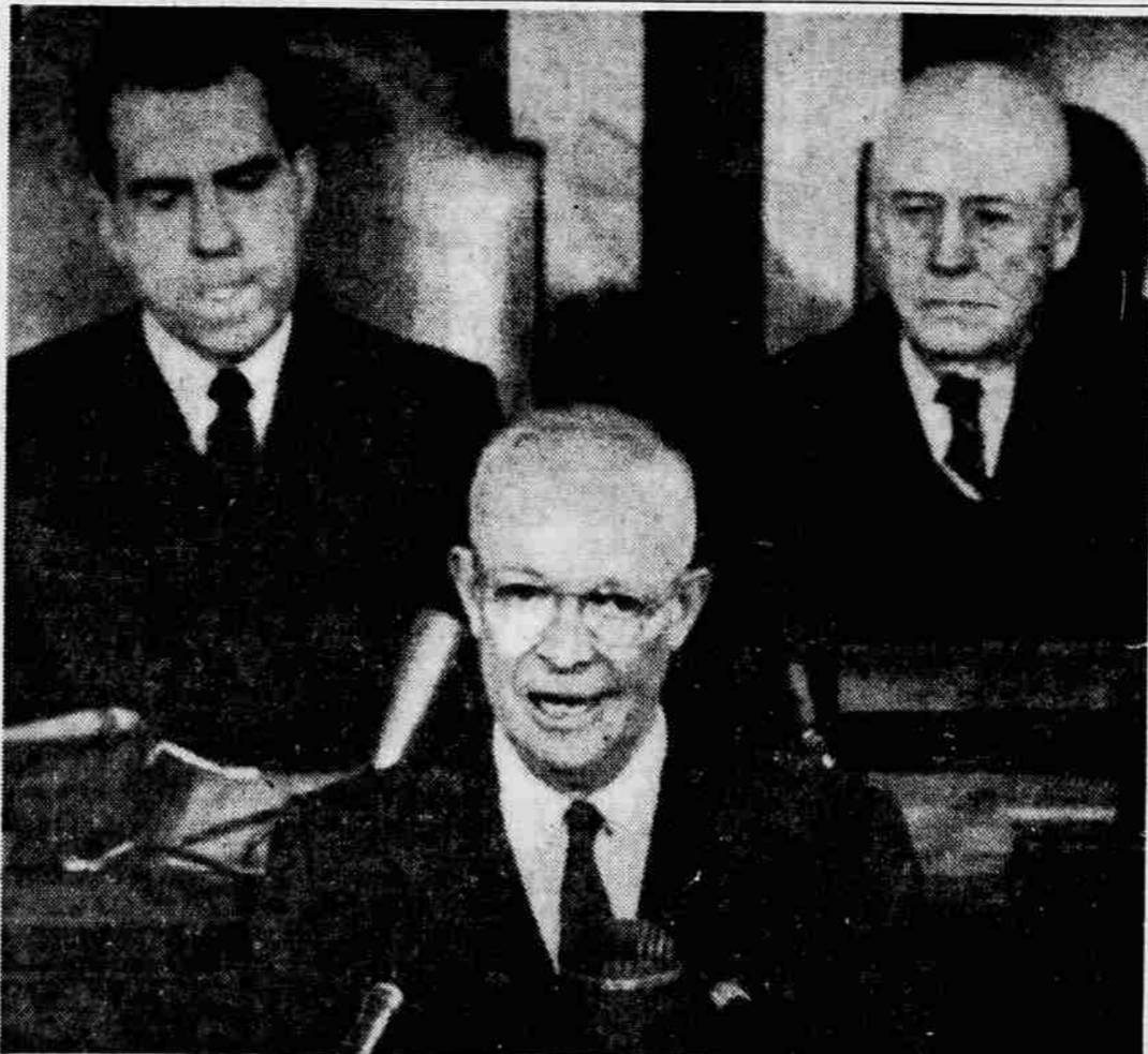
IKE DELIVERS MESSAGE — President Eisenhower is shown delivering his State of the Union message to a joint session of Congress this morning. Seated behind the President are Vice President Richard Nixon and Speaker of the House Sam Rayburn.

Eisenhower obviously mindful of Democratic criticism of his administration's defense policies, promised that no matter how earnest the quest for peace, America would remain militarily strong even while attempting to negotiate arms reduction.