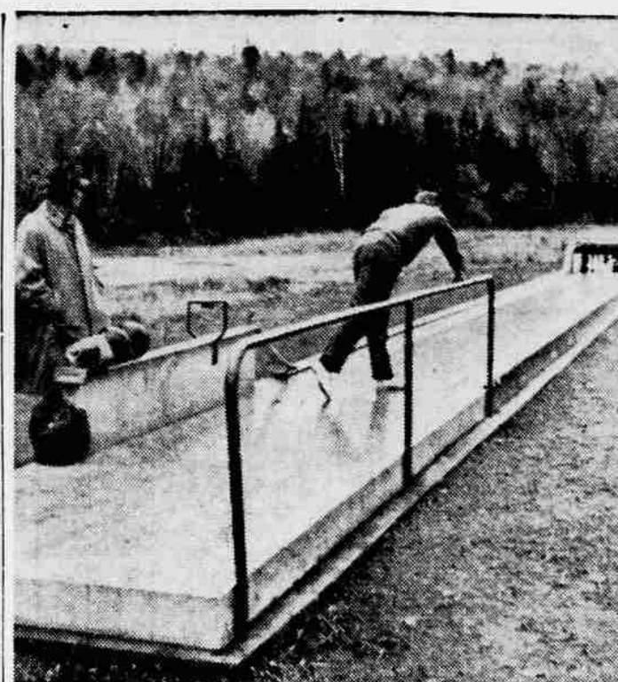
OUTDOOR BOWLING ALLEY -Despite chill weather, a bowler makes his mark on this granite bowling alley just outside Barre, Vt. The Barre Granite Association says this lane has withstood temperatures ranging from 40 degrees below zero to 90 degrees above.