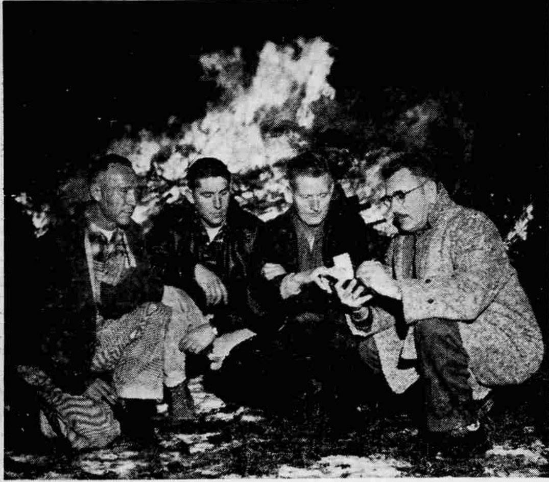
TREES BURNED — The proverbial "last years' Christmas tree" may be worthless on the open market, but 30 members of the Moose lodge, with the help of an equal number of Boy Scouts, turned discarded trees into a profit of $206.25 in their annual pickup Sunday. The Christmas trees were burned on Antelope rd. Tallying up the "take,"